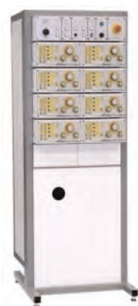
PrimaTech Control Unit