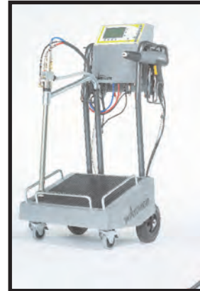
Bravo Manual Unit

Ask your Representative for a Demonstration Today!