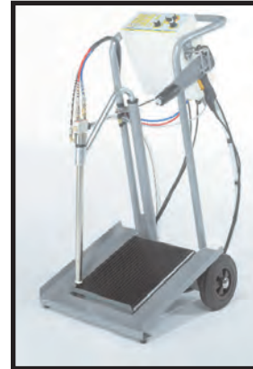
Prima Manual Unit

“Prima”, “Classic” and “Super Series” booths are compatible with all Wagner application technology including manual and automatic equipment.