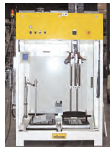
Powder Center 2005