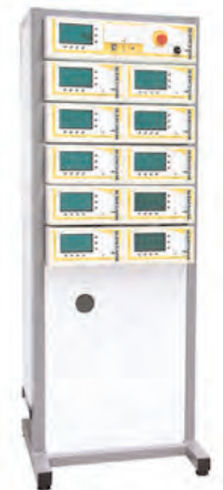
DigiTech Control Unit

Ask your Representative for a Demonstration Today!