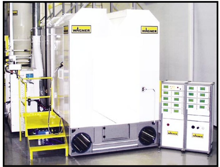
Wagner Systems SuperTech Automatic Spray Booth